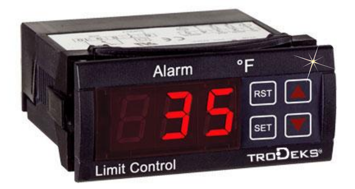
CN701 shown actual size.