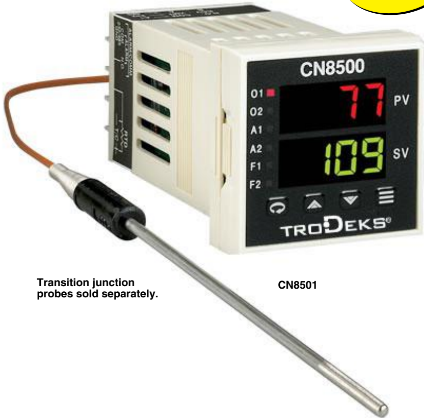
Transition junction probes sold separately.

Control algorithms available are P, PI, PD, PID, or on/off. The autotune feature automatically sets proportional band, rate and reset before the process reaches setpoint. These parameters provide quick stabilization of both the heating and cooling process without overshoot, hunting or cycling. The standard dual control outputs can be configured in a variety of control and alarm applications such as