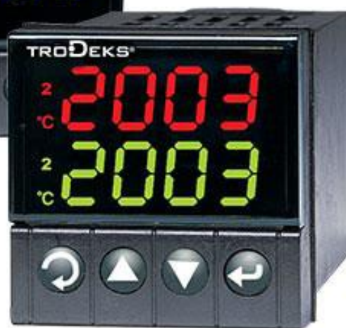
CNi16D33 shown larger than actual size.

The TRODEKS® CNi16 is the popular 1/16 DIN size (48 mm²) controller. It is available with a single (model CNi16) or dual display (model CNi16D) that displays a setpoint along with the process value. The CNi16 display can be programmed to change color between GREEN , AMBER , and RED at any setpoint or alarm point. The CNi16 is the first 1/16 DIN controller with the option of both RS232 and RS485 in 1 instrument with straightforward TRODEKS® ASCII protocol. And of