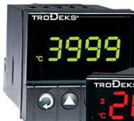
CNi1633 shown larger than actual size.