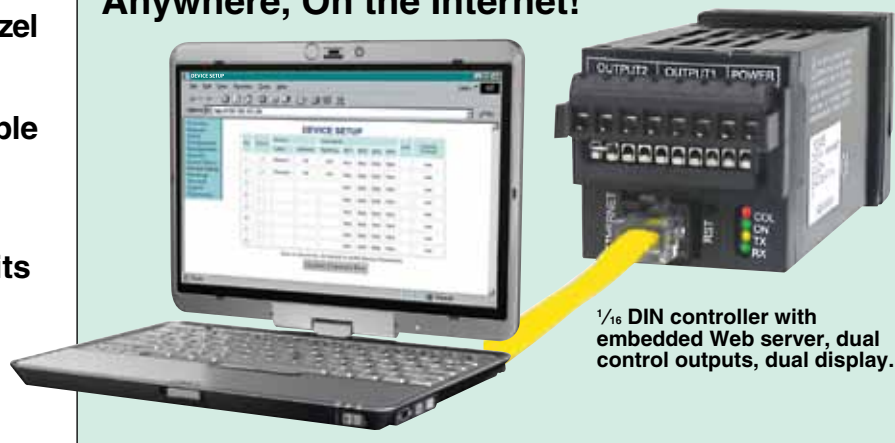
1/16 DIN controller with embedded Web server, dual control outputs, dual display.