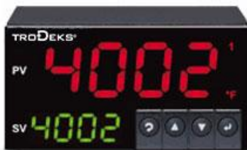
CNi8DH33, shown smaller than actual size.

The CNi8DH and CNi8DV come standard with your choice of 2 control or alarm outputs in almost any combination: solid state relays rated at 0.5 A @ 120/240 Vac; Form "C" SPDT relays rated at 3 A @ 120/240 Vac; pulsed 10 Vdc output for use with an external SSR; or analog output (0 to 10 Vdc or 0 to 20 mA) selectable for control or retransmission of the process value.