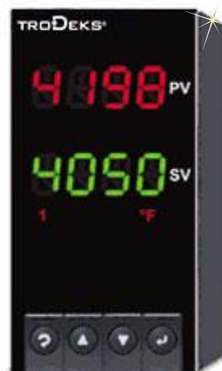
CNi8DV33, shown smaller than actual size.

The universal temperature and process instrument (CNi8 models) offer a selection of 10 thermocouple types as well as 2-, 3- or 4-wire RTDs, process voltage and current. The CNi8DH and CNi8DV are ideal controllers for use with transmitters and amplified transducers. Built-in excitation is standard (24 Vdc @ 25 mA). The units handle 0 to 20 mA process current and process voltage in 3 scales: 0 to 100 mV, 0 to 1V, and 0 to 10V.