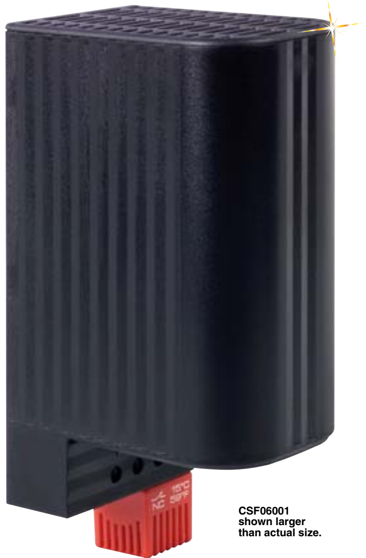
CSF06001 shown larger than actual size.

Touch-safe heater for the use in enclosures with electrical/electronic components. The design of the heater supports the natural convection which results in a high air-current of warm air. The surface temperatures on the accessible side surfaces of the housing are kept down as a result of the heater design. This model with plug-in thermostat does not require additional wiring. The heaters are designed for permanent operation. This heater is also available in a version without thermostat (CS 060).