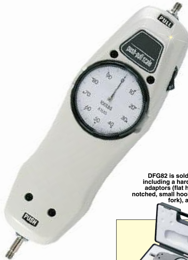
DFG82-100, shown close to actual size.

The DFG82 Series laboratory-grade mechanical force gages are durable yet highly accurate, making them ideal for tension and compression quality control measurements. DFG82 gages are sold in kits, complete with meter, hard case, measuring adaptors (flat head, cone, chisel, notched, small hook, large hook, and fork), and extension rod. The ergonomic design is well suited for handheld testing.