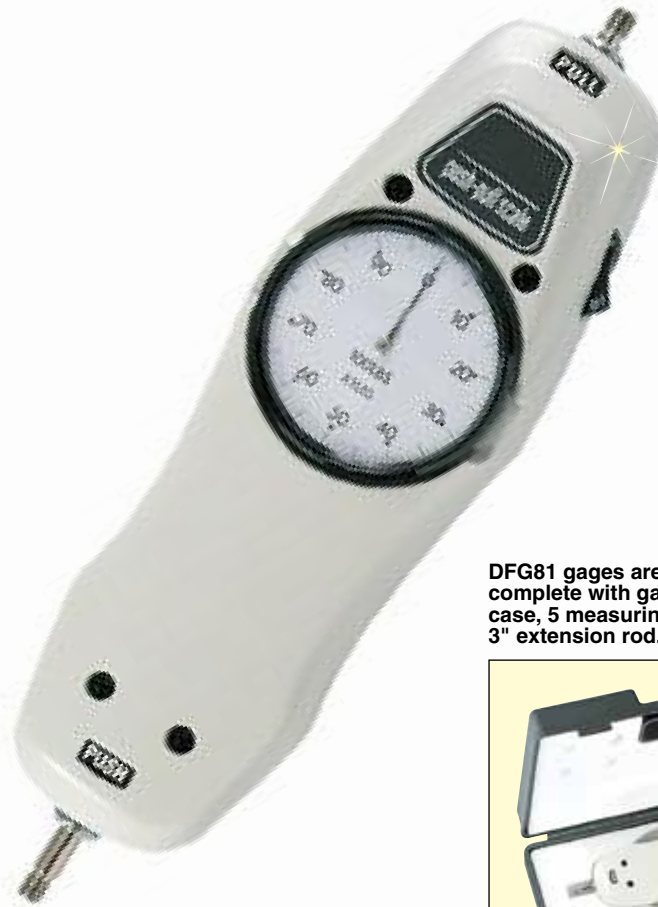
DFG81-1KG, shown close to actual size.

The ruggedly constructed DFG81 gages will withstand harsh industrial environments yet remain accurate to ±0.3%. These gages are sold as kits complete with gage, hard carrying case, 5 measuring tips, and a 3-inch extension rod. The ergonomic design makes the DFG81 ideal for handheld use. It can also be mounted on a test fixture.