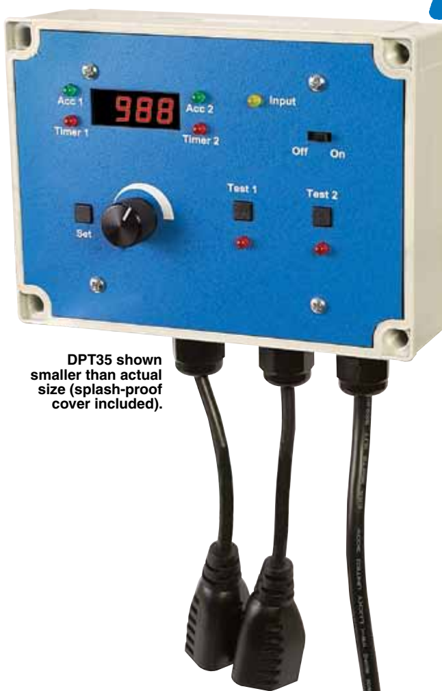
DPT35 shown smaller than actual size (splash-proof cover included).