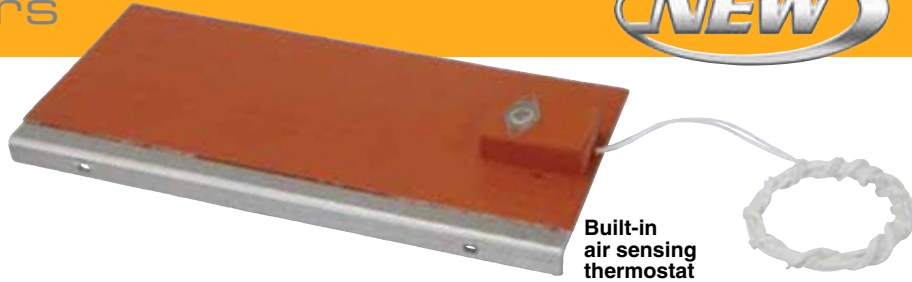
Built-in air sensing thermostat