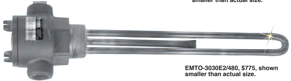
EMTO-3030E2/480, $775, shown smaller than actual size.