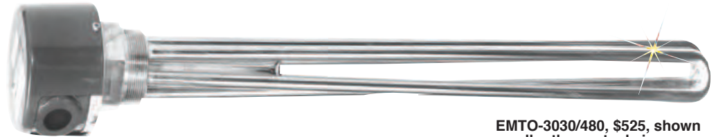
EMTO-3030/480, $525, shown smaller than actual size.

Enclosures: E1 general purpose 1 , NEMA 1 (IP00) rated, or type E2 moisture-resistant/explosion-resistant enclosure. 2