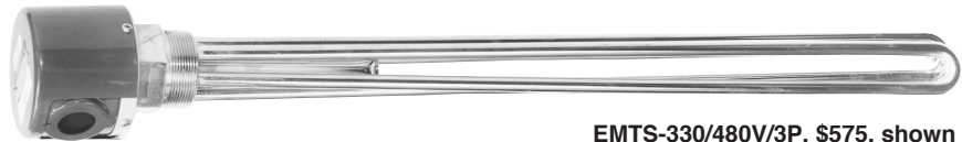
EMTS-330/480V/3P, $575, shown smaller than actual size.