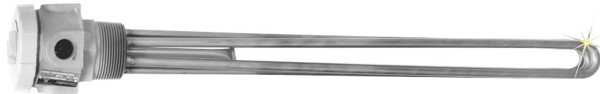
EMTS-360E2/480V/3P, $1050, shown smaller than actual size.