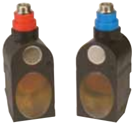
FDT-21-M2, medium pipe, standard transducer