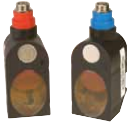
FDT-21-M2H, replacement medium pipe, high-temperature transducer