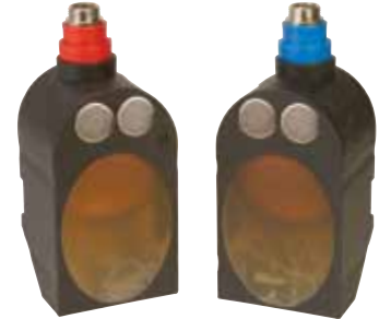
FDT-21-L2H, large pipe, high-temperature transducer