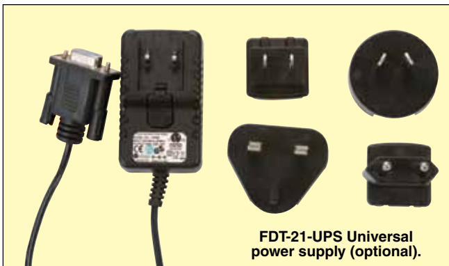
FDT-21-UPS Universal power supply (optional).

Rate Units (User Configured): Meter, feet, cubic meter, cubic feet, USA gallon, oil barrel, USA liquid barrel, imperial liquid barrel, million USA gallons