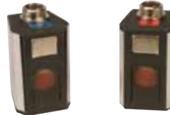
FDT-21-S2H, small pipe, high-temperature transducer