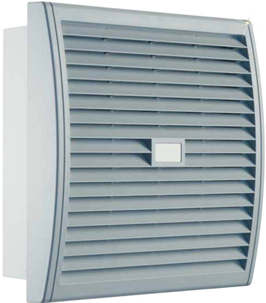
FF01803000 shown smaller than actual size.

Axial Fan: Ball bearing, aluminum frame, plastic impeller UL94V-0, Operational life min. 50,000 hrs at 25°C (77°F) (RH 65%); operating temperature -45 to 70°C (-49 to 158°F) 2 lead wires 4" long with pressure clamps, type AWG 14 max