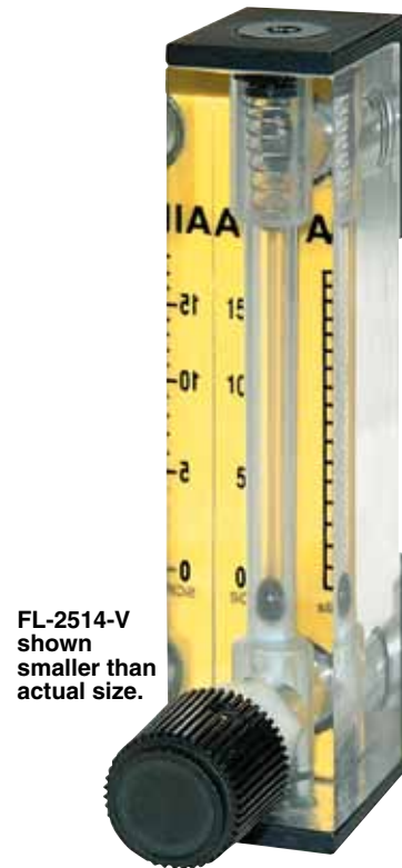
FL-2514-V shown smaller than actual size.

The FL-2500 Series direct read rotameter kits offer versatility at a low cost. Each kit includes seven interchangeable direct read scales for air, water, Argon, CO 2 , Helium, Nitrogen and Oxygen. These economical kits are ideal for laboratories, schools or processes that use multiple gases.