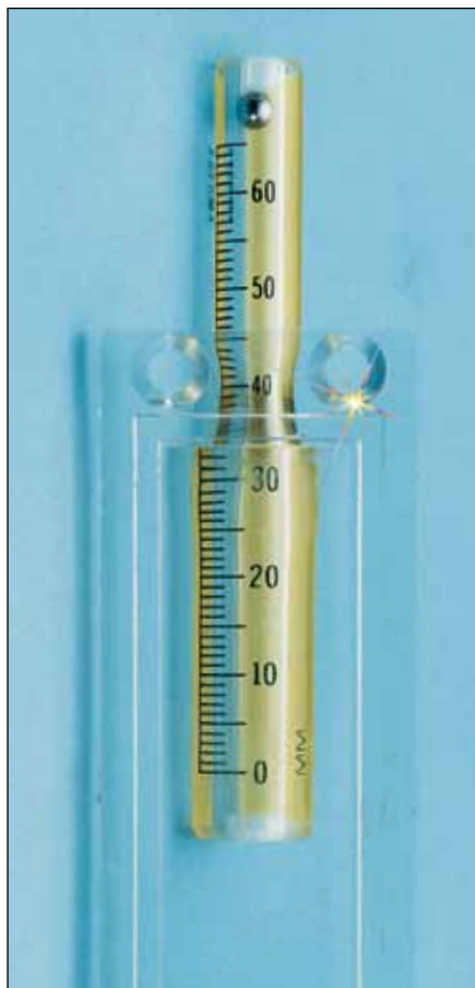
Polycarbonate shield acts as a magnifier to insure high accuracy reading with less eye fatigue.

Comes complete with correlation sheets for air and water with instructions printed is on the back.