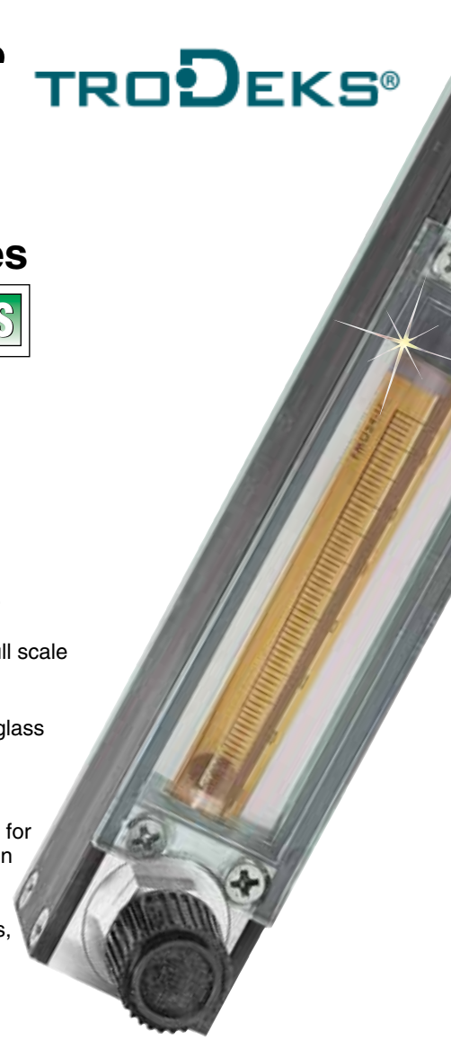
FL-3607G, shown close to actual size.