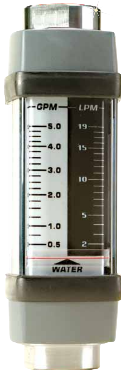
FL-6404A-316 shown actual size.