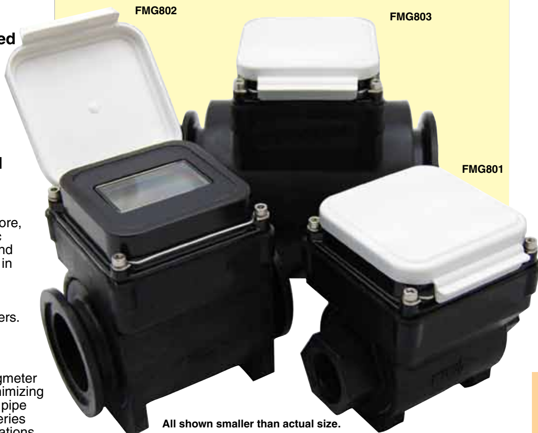
All shown smaller than actual size.

The FMG800 Series is used for tracking flow rate and total flow in usage monitoring applications including wells, industrial wastewater, heap leach mining discharge, cooling tower deduct, turf, landscape, and other water reclamation applications. In the event of DC power loss, or when changing batteries, the FMG800 will retain internal settings and flow total.