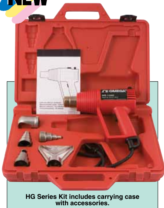
HG Series Kit includes carrying case with accessories.