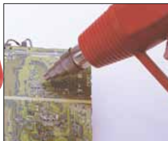
HG1500 heat gun being used to desolder an electronics board.