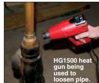
HG1500 heat gun being used to loosen pipe.