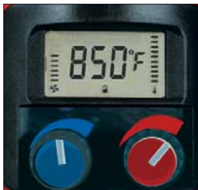
HG1400 digital display.