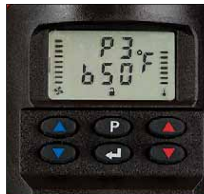
HG1500 digital display.