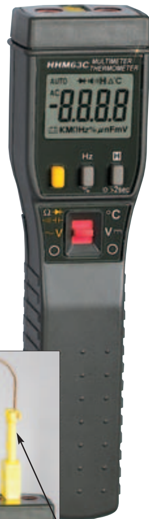
HHM63C/HHM63F Multimeter Thermometer 2500 count resolution W/microprocessor-based DMM DCV accuracy: 0.25% Resistance accuracy: 0.3% Backlit LCD display Frequency accuracy up to ± 0.05% Frequency resolution up to 0.001 Hz Type K input Temp. accuracy ± 2%