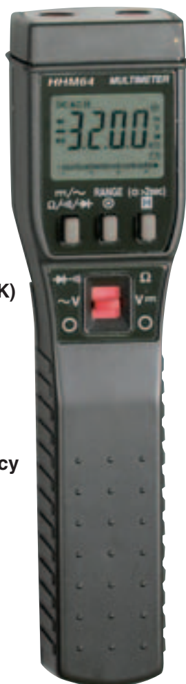
HHM64 Stick Type Multimeter 3200 count resolution Analog bargraph function Backlit LCD display DCV accuracy: 0.25%