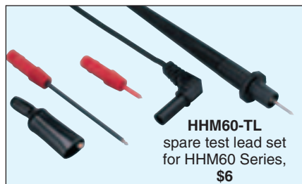
HHM60-TL spare test lead set for HHM60 Series, $6