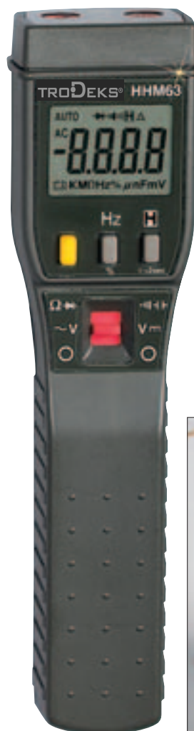
HHM63 Stick Type Multimeter 2500 count resolution W/Microprocessor-Based DMM DCV Accuracy: 0.25% Resistance accuracy: 0.3% Backlit LCD display Frequency accuracy up to ± 0.05% Frequency resolution up to 0.001 Hz