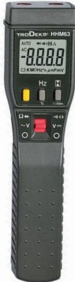
HHM63 Stick Type Multimeter 2500 count resolution W/Microprocessor-Based DMM DCV Accuracy: 0.25% Resistance accuracy: 0.3% Backlit LCD display Frequency accuracy up to ± 0.05% Frequency resolution up to 0.001 Hz