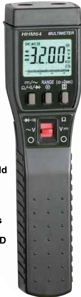
HHM64 Stick Type Multimeter 3200 count resolution Analog bargraph function Backlit LCD display DCV accuracy: 0.25%