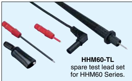
HHM60-TL spare test lead set for HHM60 Series.