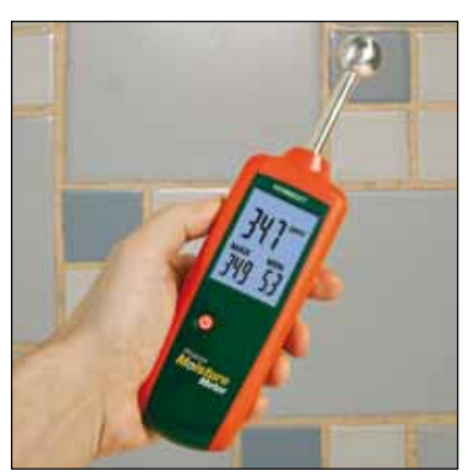
Measures relative moisture of various building materials including wood, particle board, carpeting, and ceiling tiles using non-invasive pinless technology.

The pinless HHMM257 handheld moisture meter incorporates a moisture sensor that monitors the moisture in wood and other building materials without causing surface damage. High frequency sensing technology allows the meter to take non-invasive moisture measurements. The HHMM257 has an easy-to-read backlit LCD display that can be manually turned on or off. User programmable alarms alert the user if moisture measurements exceed alarm set-points. This meter is shipped fully tested and calibrated, and with proper use, will provide years of reliable service.