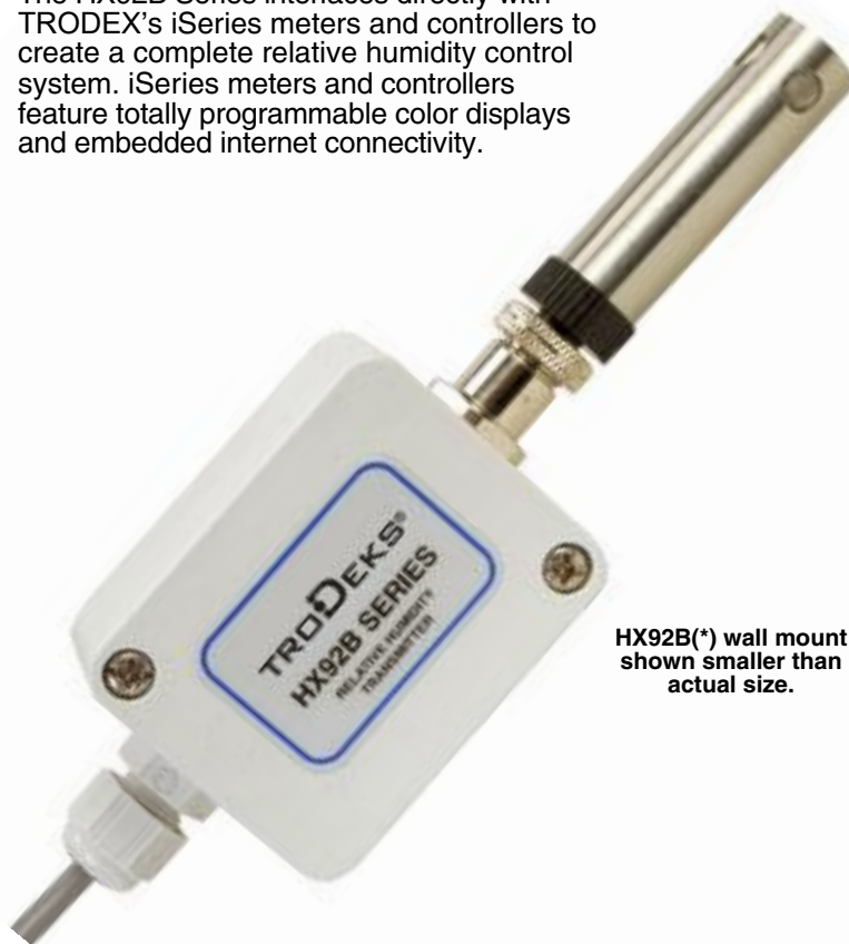
HX92B(*) wall mount shown smaller than actual size.

The HX92B Series interfaces directly with TRODEX's iSeries meters and controllers to create a complete relative humidity control system. iSeries meters and controllers feature totally programmable color displays and embedded internet connectivity.