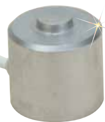
LC304-1K, shown actual size.