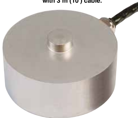
LCM305-2KN, shown actual size.