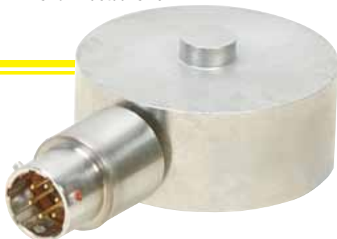
LC315/LCM315 models with twist-lock connector.