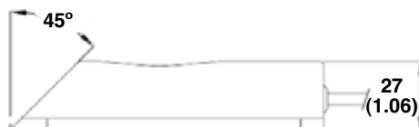
LVTX-12, 160 kHz