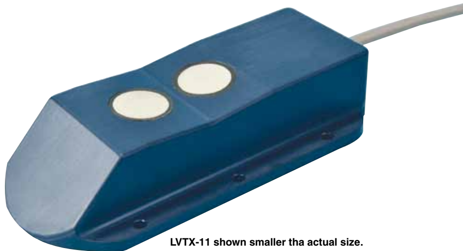
LVTX-11 shown smaller than actual size.

LVTX-10 sensors include an advanced diagnostic feature that will retrieve the ultrasonic waveform for analysis, and display it on any computer to aid users with debugging complex installations. For solid materials, surface unevenness is unlikely to affect maximum ranging capability. An integrated mounting plate with pre-formed holes is provided