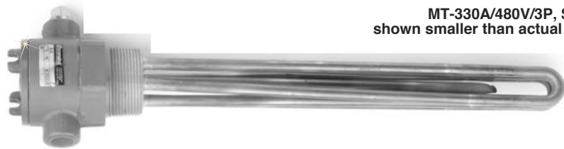
MT-330A/480V/3P, $330, shown smaller than actual size.