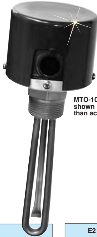
MTO-105/120, $220, shown smaller than actual size.