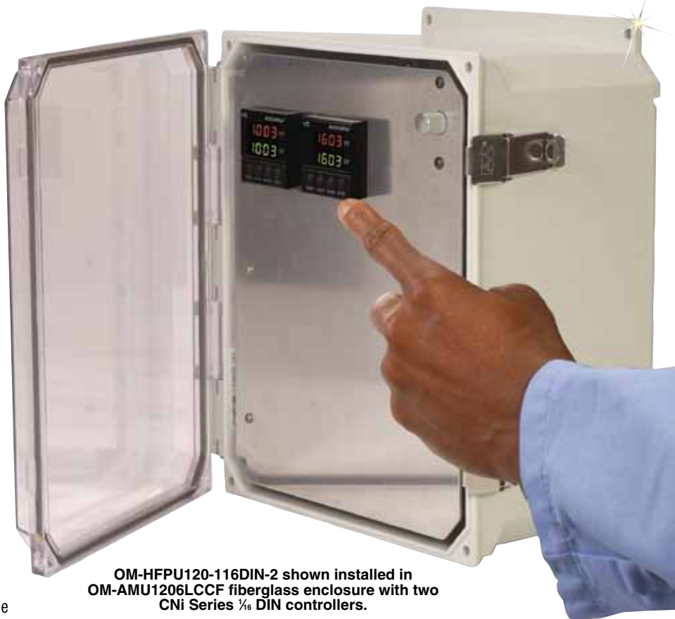
OM-HFPU120-116DIN-2 shown installed in OM-AMU1206LCCF fiberglass enclosure with two CNI Series \frac{1}{8} DIN controllers.

OM-AMU series non-metallic fiberglass enclosures are designed to insulate and protect electrical controls and components in both indoors and outdoors applications and are especially well suited for higher temperatures and corrosive environments. These NEMA 4X (IP66) fiberglass JIC junction boxes feature clear polycarbonate covers with a variety of screw or latching options.