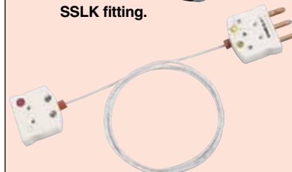
TECU10-MTP extension cable.