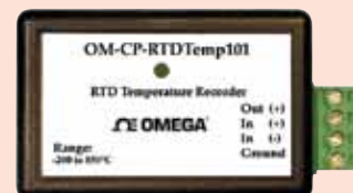
OM-CP-RTDTEMP101 precision data logger.