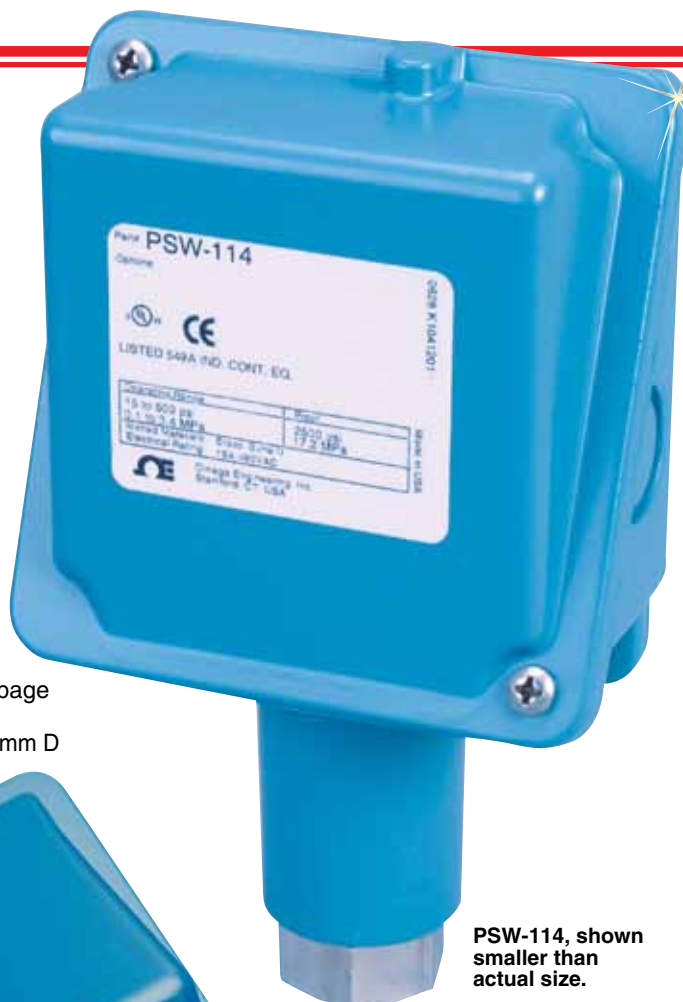
PSW-114, shown smaller than actual size.

Dimensions: 191 max H x 101 W x 60 mm D (7.5 x 4 x 2.3")