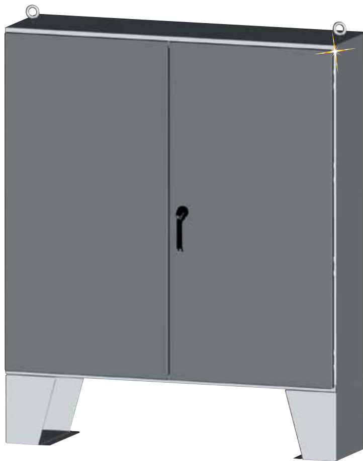
SCE-604808LP shown smaller than actual size.