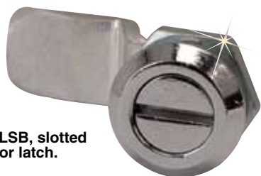
SCE-DLSB, slotted door latch.