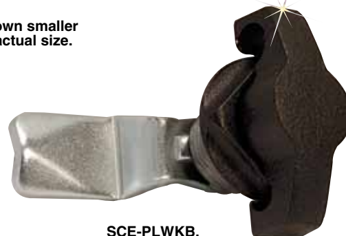
SCE-PLWKB , padlocking wing knob.