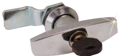
SCE-ELKLH, "T" handle.