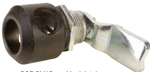
SCE-PLHG , pad lock latch.