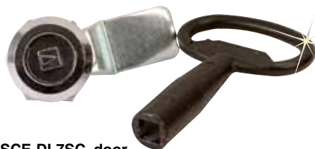
SCE-DL7SC, door latch with key.