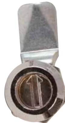
SCE-DLCA , coin proof door latch.