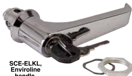
SCE-ELKL, Enviroline handle.