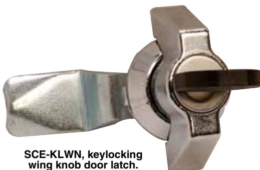
SCE-KLWN , keylocking wing knob door latch.