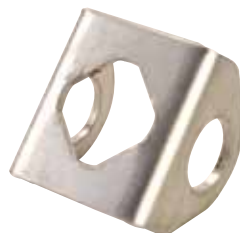
SCE-MINIQL , pad lock latch.