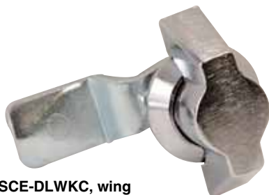
SCE-DLWKC, wing knob latch.