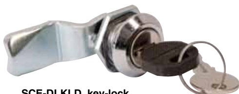
SCE-DLKLD, key-lock door latch.