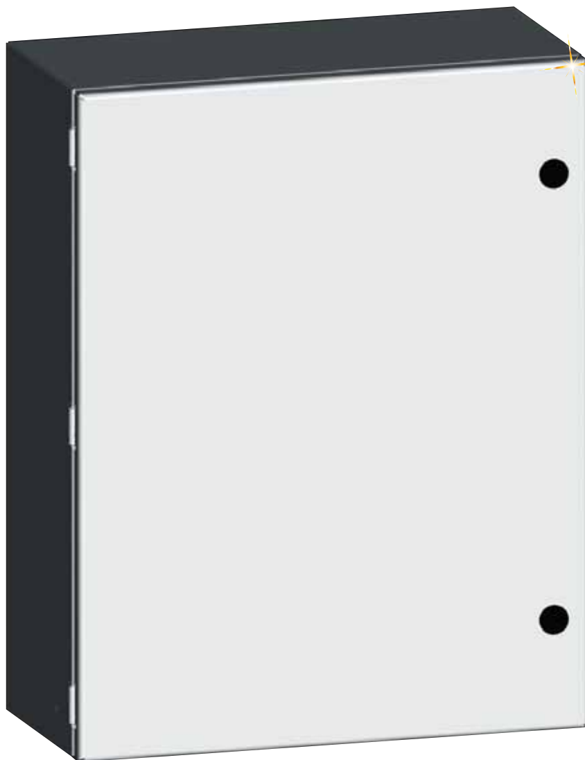
SCE-12EL1206SSLP shown smaller than actual size.