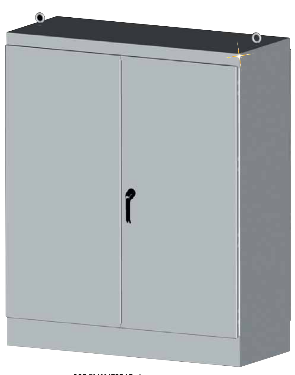
SCE-724824FSDAD shown smaller than actual size.