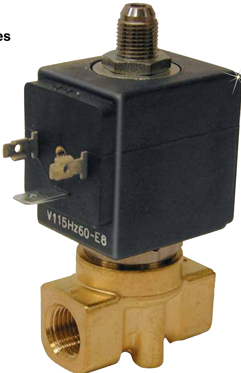
SV4101 shown larger than actual size.

A strain-relief connector is supplied with each unit. A ½" conduit plug is also available.