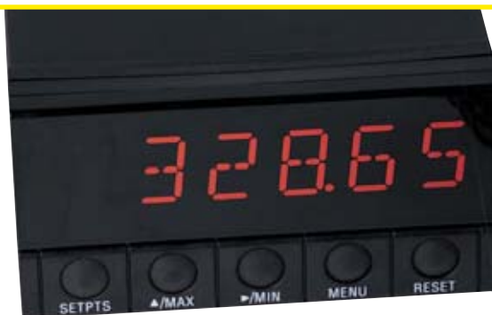
DP41-S, meter, $545, shown smaller than actual size, see page D-29.

Rated Output: 1 to 3 mV/V nominal (calibration sheet provided) Excitation: 10 Vdc, 20 Vdc maximum Accuracy: ±0.37% FS Linearity: ±0.25% FS Hysteresis: ±0.25% FS Repeatability: ±0.1% FS Zero Balance: ±1.0% FS Operating Temp Range: -55 to 120°C (-65 to 250°F) Compensated Temp Range: 0 to 75°C (32 to 170°F) Thermal Effects: Zero: ±0.002% FS/°F Span: ±0.002% rdg/°F Max Load: Safe: 115% FS (TQ502-600, TQ502-2.4 K), 150% FS (other models) Ultimate: 150% FS (TQ502-600, TQ502-2.4 K), 200% FS (TQ502-1.5K, TQ502-6 K), 300% (other models) Bridge Resistance: 1000 Ω Maximum rpm: 3000 Brush Life (Hours): 4.6 x 10 6 /rpm Construction: Sensor: Black anodized tool steel Housing: Black anodized aluminum Electrical: Mating connector supplied Weight: 226 g (8 oz)