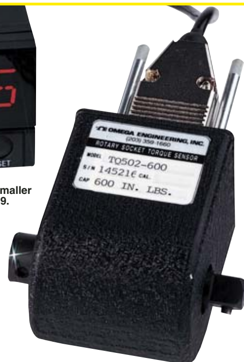
TQ502-600, $1635, shown smaller than actual size.