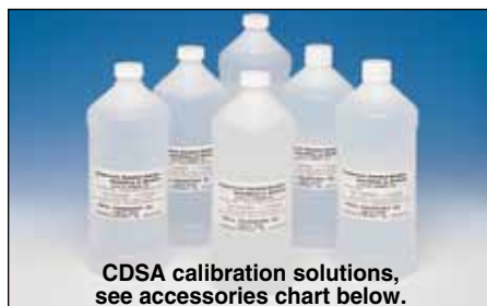
CDSA calibration solutions, see accessories chart below.