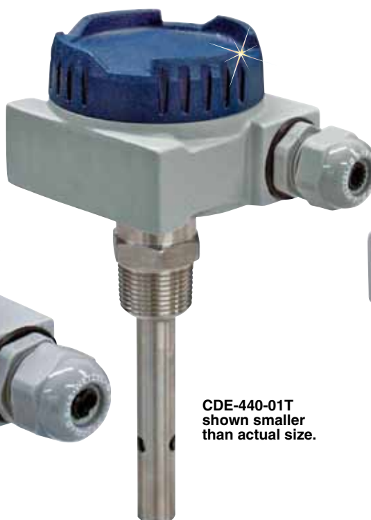
CDE-440-01T shown smaller than actual size.