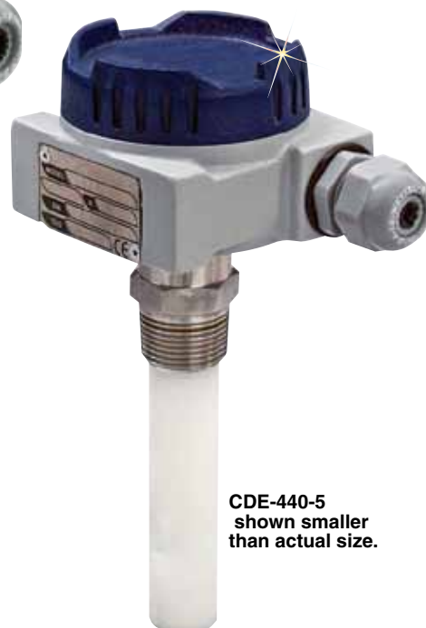
CDE-440-5 shown smaller than actual size.