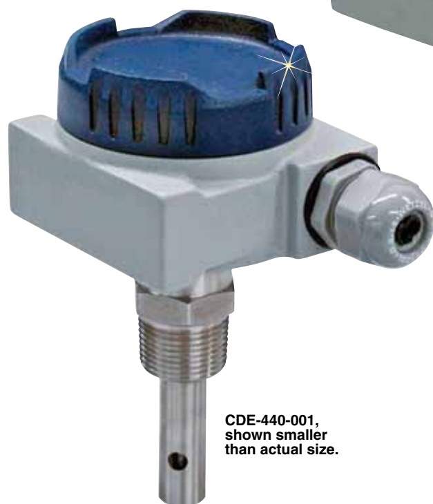
CDE-440-001, shown smaller than actual size.