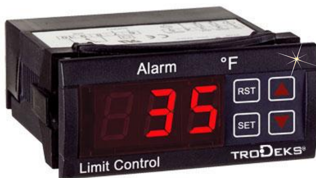
CN701 shown actual size.