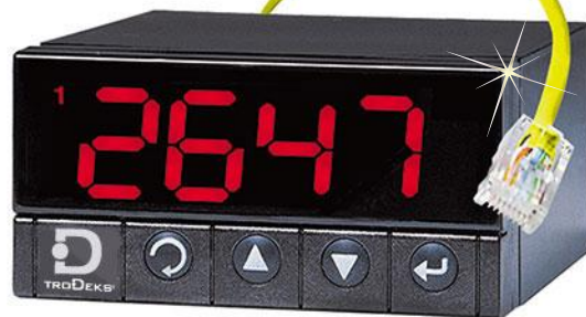
Shown smaller than actual size.

The CNi8 covers a broad selection of transducer and transmitter inputs with 2 input models.