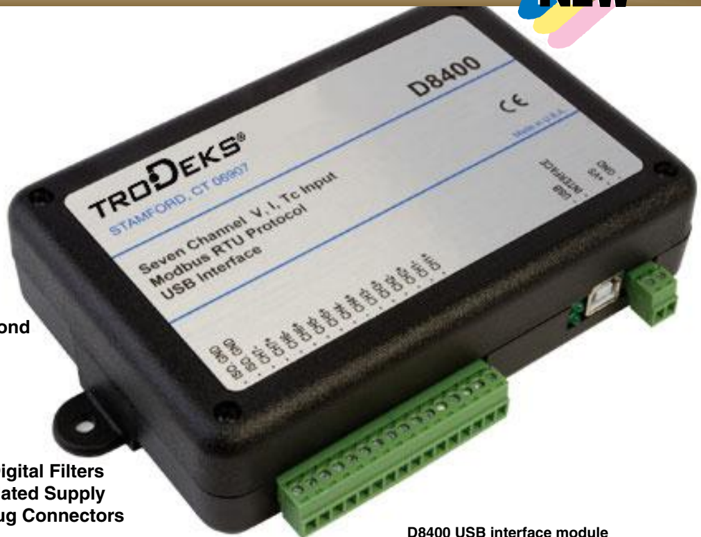
D8400 USB interface module shown smaller than actual size.