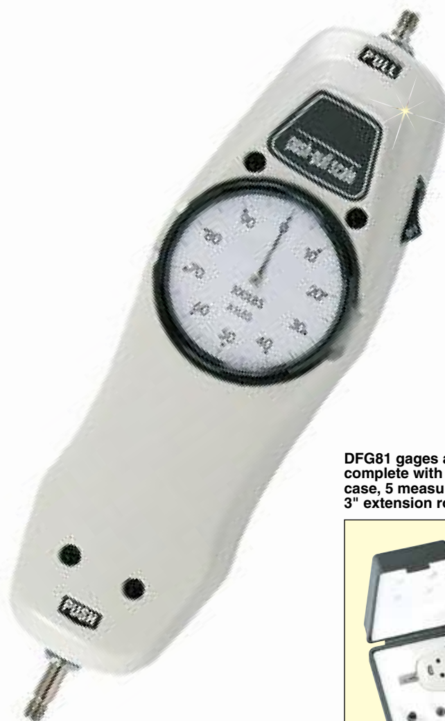
DFG81-1KG, shown close to actual size.

The ruggedly constructed DFG81 gages will withstand harsh industrial environments yet remain accurate to ±0.3%. These gages are sold as kits complete with gage, hard carrying case, 5 measuring tips, and a 3-inch extension rod. The ergonomic design makes the DFG81 ideal for handheld use. It can also be mounted on a test fixture.