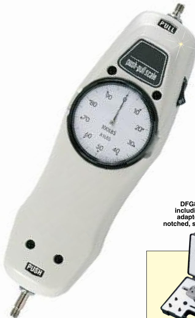
DFG82-100, shown close to actual size.

The DFG82 Series laboratory-grade mechanical force gages are durable yet highly accurate, making them ideal for tension and compression quality control measurements. DFG82 gages are sold in kits, complete with meter, hard case, measuring adaptors (flat head, cone, chisel, notched, small hook, large hook, and fork), and extension rod. The ergonomic design is well suited for handheld testing.