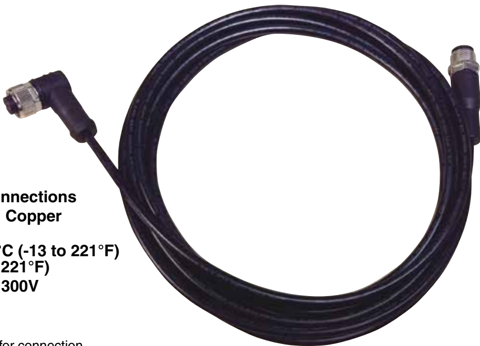
DM12CAB-8-1-RA shown smaller than actual size.

These extension cables can be used for connection transmitters or sensors such as TRODEKS® electronics ZW and Smart Sensors to process instrumentation. Each extension cable has 7 conductors plus a drain with an 8-pin M12 connector on each end. They are available with straight or right angle connectors in 3 standard lengths of 1, 3, or 5 m (3.3, 9.8, or 16.4').