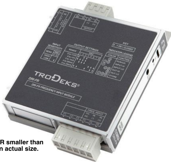
DRI-FR smaller than shown actual size.

Isolation: 1800 Vdc between input, output and power