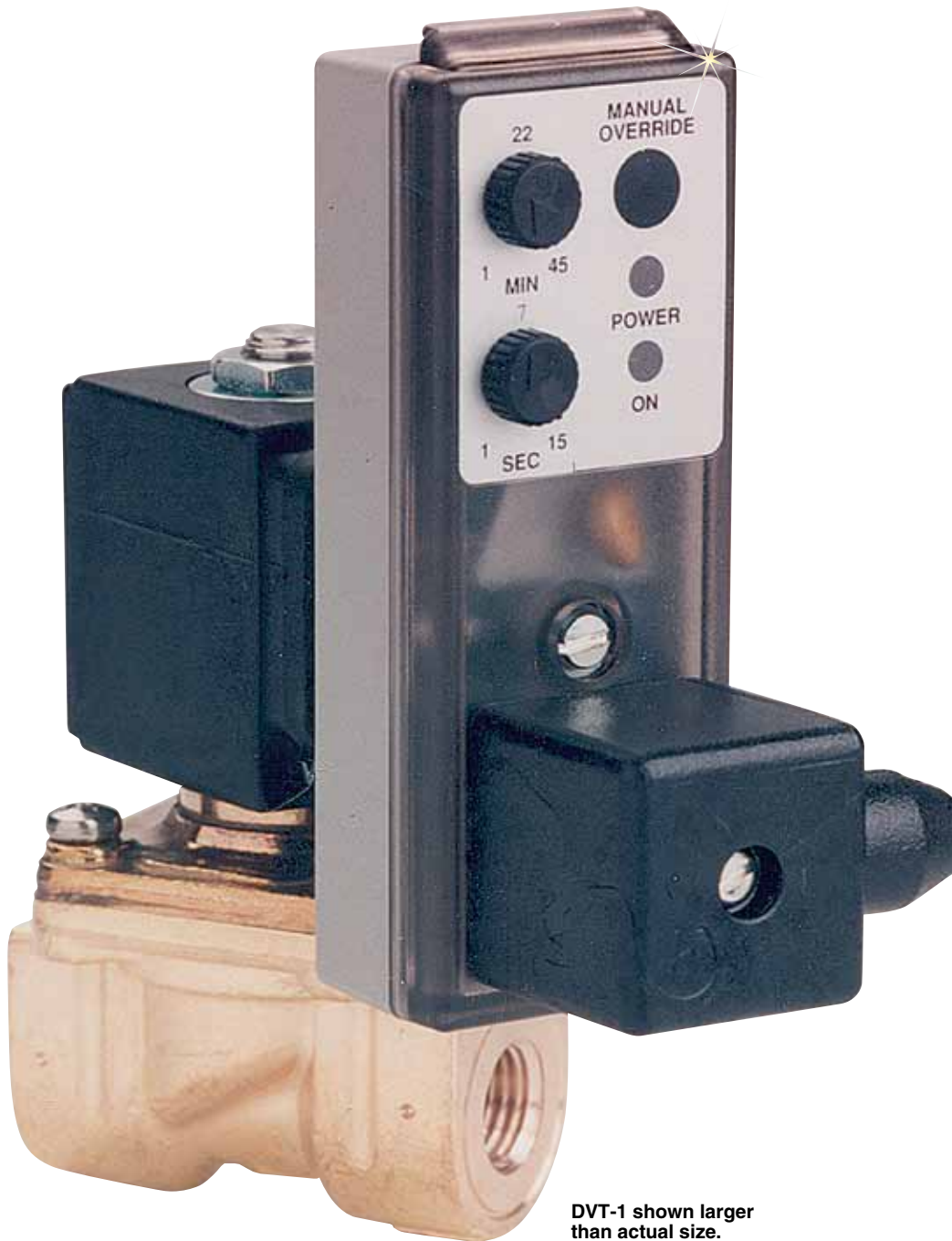
DVT-1 shown larger than actual size.

TRODEX's DVT electronic drain feature external adjustable timing from 1 to 15 seconds on timing and 1 to 45 minutes off timing. Units have manual test/override button and light diodes for mode of operation. The timers can be used for voltages from 24 to 240/50 to 60 Hz.