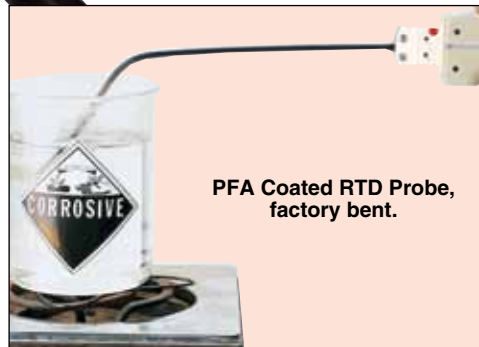
PFA Coated RTD Probe, factory bent.

RTD probes that are available with PFA coatings are the PR-11, PR-12, PR-13, PR-14, PR-15, PR-16, PR-17, PRS-GP and PRS-FR, as well as the RTD-810 probe.