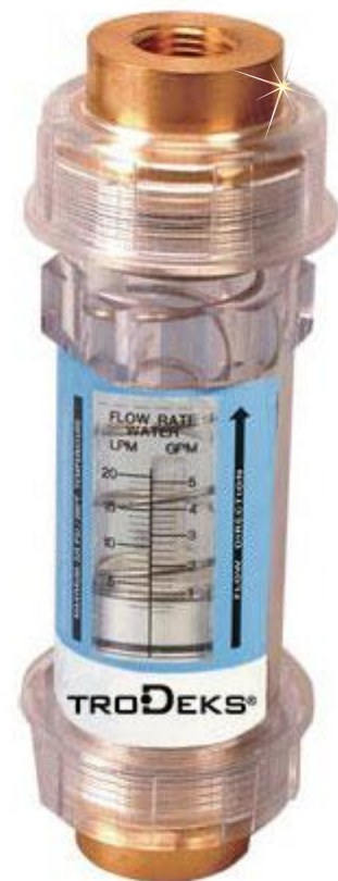
FLC-W11 shown smaller than actual size.