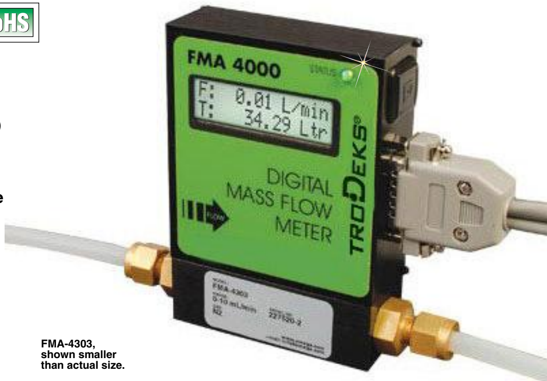
FMA-4303, shown smaller than actual size.

The FMA-4100/4300 Series flow rate can be displayed in 23 different volumetric flow or mass flow engineering units including a user specific selection. Flowmeters can be programmed remotely via RS232 or RS485 (optional). FMA-4100/4300 flowmeters support various functions including, programmable flow totalizer, high and low flow alarm, automatic zero adjustment, 2 relay outputs, jumper selectable 0 to 5 Vdc or 4 to 20 mA analog outputs, status LED diagnostic, storage of up to 10 different gas calibrations, internal or user-specific K-factors. Display models have local 2 lines x 16 characters LCD display with adjustable back light provides flow,