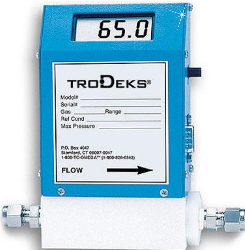
FMA-A2417 with display, shown smaller than actual size.

The FMA-A2000 Series electronic mass flowmeters/controllers provide high performance, versatility, and state-of-the-art design in one compact package. The FMA-A2000 uses capillary-type thermal technology to directly measure mass flow of gases. No temperature, pressure, or square root corrections are required. The FMA-A2300/2400 Series comes with an LCD display, and all models have linear 0 to 5 Vdc and 4 to 20 mA output.