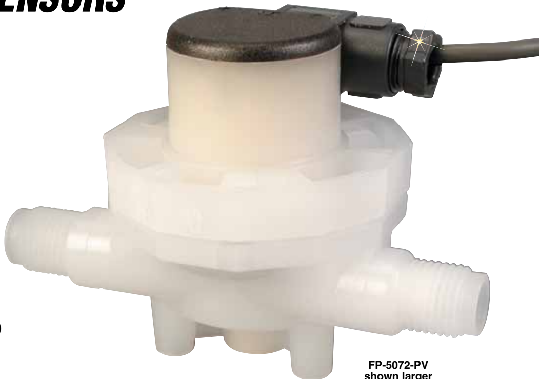
FP-5072-PV shown larger than actual size.

The TRODEX® FP-5070 Mini-Flow sensor is ideal for precision low flow monitoring. The FP-5070 is available in four flow range configurations, covering a very wide range of flows. This allows for easy selection of the range that best fits your application. Typical applications include pilot plant installations, monitoring of critical flows in laboratories, fluid dispensing, bottling lines, and medical flow applications. Other successful applications include monitoring liquid ingredient additions, such as food dyes, in the food processing industry.