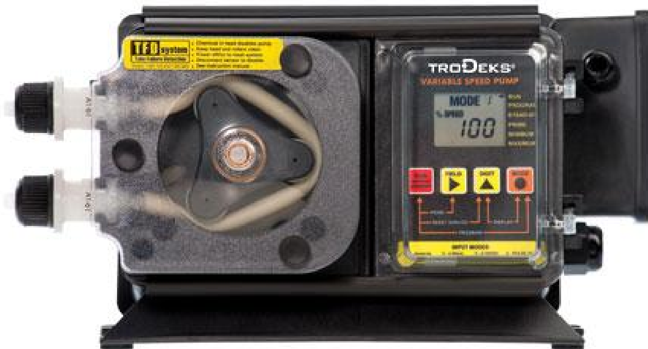
FPUDVS2003A, shown smaller than actual size.