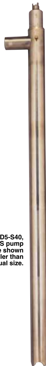
FPUD5-S40, 316 SS pump tube shown smaller than actual size.

FPUD511, 115 Vac motor, FPUD5-S40, 316 SS tube.