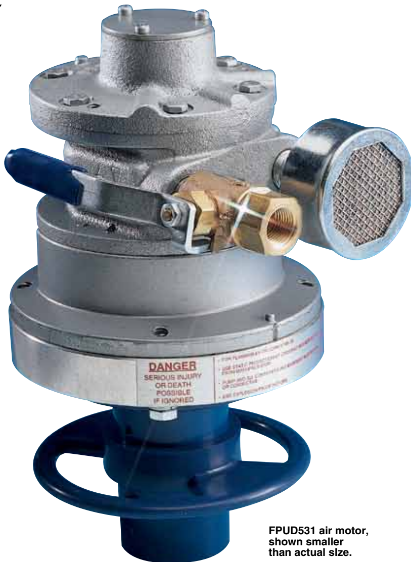
FPUD531 air motor, shown smaller than actual size.

When pumping flammable or combustible materials, or working in explosive environments, use an air motor with a stainless steel tube and FPUD5-SK static protection kit.